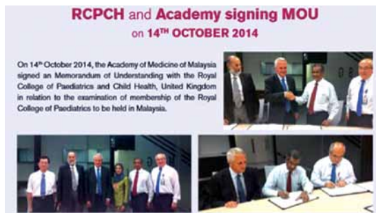
Signing of Memorandum of Understanding between the Academy of Medicine of Malaysia with the Royal College of Paediatrics and Child Health United Kingdom, 14 th October 2014.