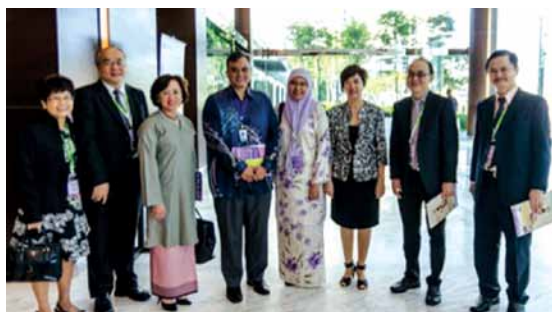
Kuala Lumpur International Neonatology Conference (KLINC), 12 th November 2015, Opening Ceremony, co-organised by University of Malaya, Perinatal Society of Malaysia and College of Paediatrics, Academy of Medicine of Malaysia.