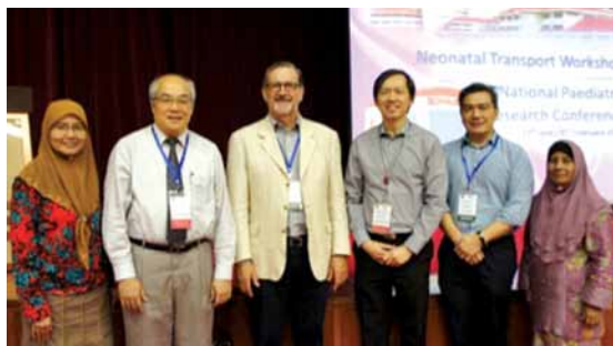
Invited speakers of the Neonatal Transport workshop 2016.