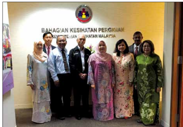
College of Dental Specialists Committee 2015/2016, during a courtesy visit to the Principal Director of Oral Health at the Oral Health Division, Ministry of Health Malaysia.

In addition, CODS has a very good working relationship with the national dental association of the country, the Malaysian Dental Association (MDA), and CODS has conducted several symposia during conferences organised by MDA, including the 35 th Asia Pacific Dental Congress held in Kuala Lumpur in 2013.