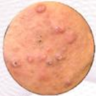
Figure III: Severe acne