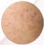
Figure I: Mild acne

Acne or pimples can present as whiteheads and blackheads (close and open comedones) or inflamed papules, nodules or cysts.