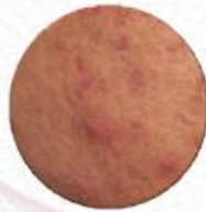
Figure II: Moderate acne