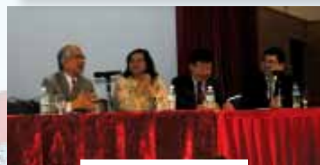
A lively discussion going on...