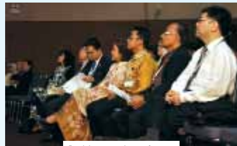
Participants at the conference

The National Institutes of Health, Ministry of Health Malaysia took the opportunity to publicise and display information on the research and services which they carry out.