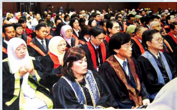
Fellows and Members attending the Conferment Ceremony