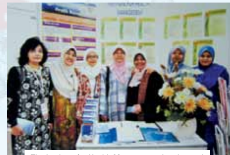
The Institute for Health Management booth stand

national interest which include the concept and updates of 1Care, equity in healthcare, sustainable healthcare financing structures and clinical research. The lectures were delivered by eminent speakers, both from local and abroad.