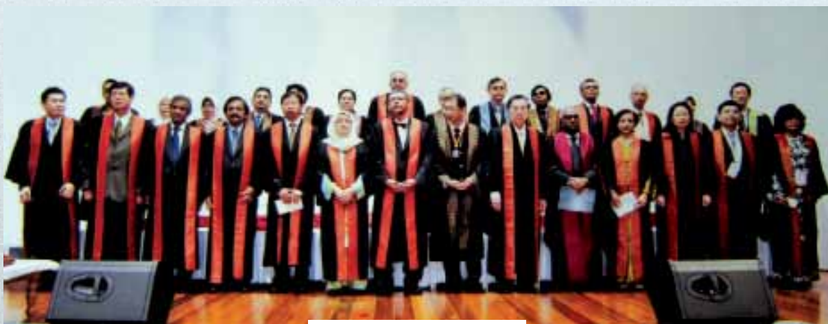
The stage party at the Opening Ceremony